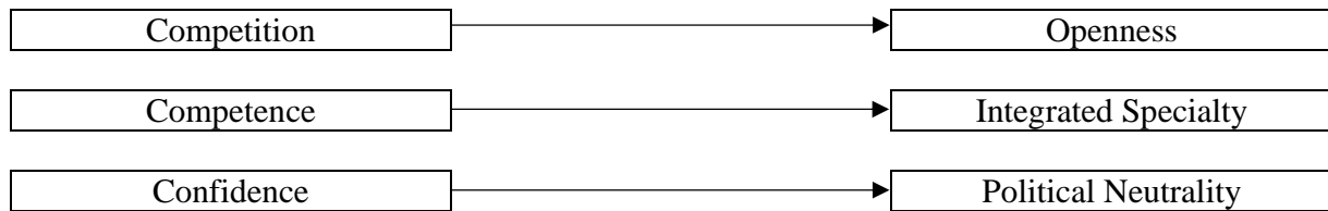
Table 4. 3C Strategies and Its Implementation Details